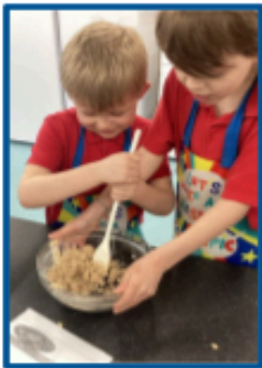
3LM had a go at making Bronze Age Cookies using an ancient grain flour 'spelt' linked with their history learning.

Every week, children are chosen to receive certificates that fit in with our Learning Muscles. This week some of the children are using their have a go muscles: