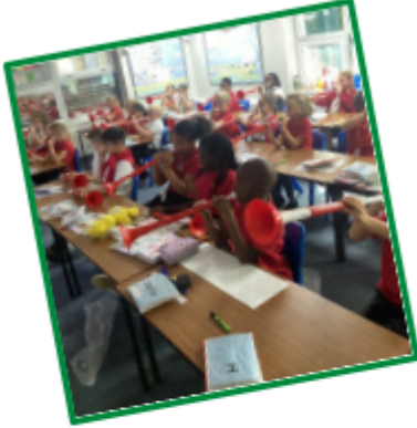
Year 4 are learning pbuzzers with the music service this year.