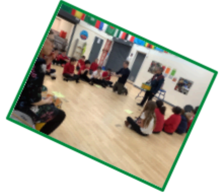
Year 6 have taken part in a samba workshop recently.

Participation in music is found across Chiltern Primary School, from the first opportunities to create sounds from a selection of instruments to expert tuition of brass instruments provided by Hull Music Service. The pupils have lots of chance to build on musical knowledge and develop exploring and appraising different musical genres.