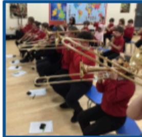
Year 5 have been learning to play brass instruments this year.